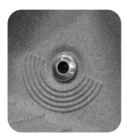
Sensation massage zones of the feet and hands