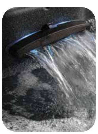
LED Waterfall With New Exclusive Design for Monsoon