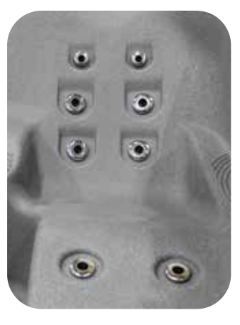
Ergonomic bed with back, leg and foot massage