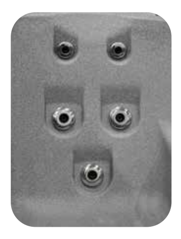
Ergonomic seats with specialized massage for maximum comfort