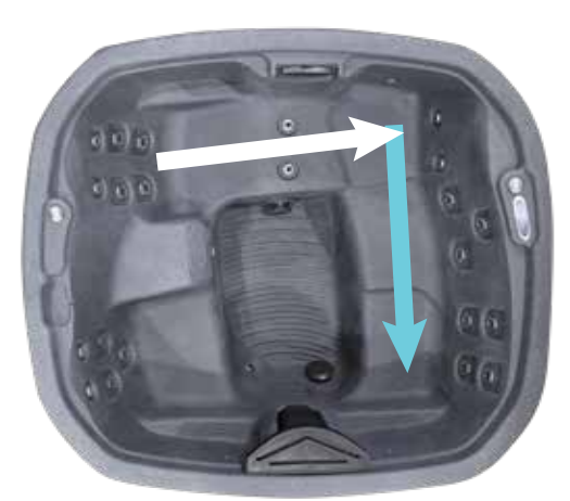
Double lounge with multi-level bottom